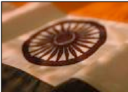
TRICIA member contribution.....